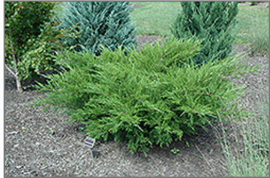
Sea Green Juniper