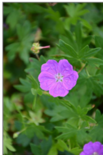
New Hampshire Purple Cranesbill flowers

New Hampshire Purple Cranesbill is a fine choice for the garden, but it is also a good selection for planting in outdoor pots and containers. It is often used as a 'filler' in the 'spiller-thriller-filler' container combination, providing a mass of flowers against which the thriller plants stand out. Note that when growing plants in outdoor containers and baskets, they may require more frequent waterings than they would in the yard or garden.