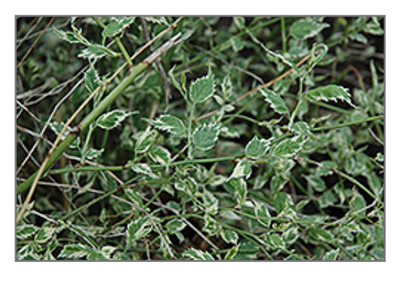
Picta Japanese Kerria foliage