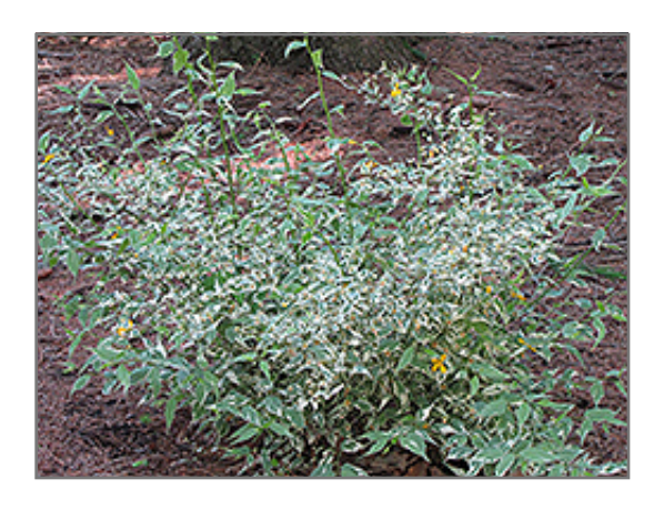
Picta Japanese Kerria

* This is a 'special order' plant - contact store for details