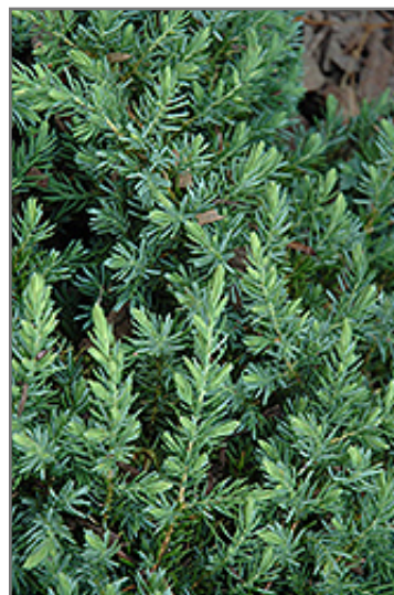
Blue Pacific Shore Juniper foliage