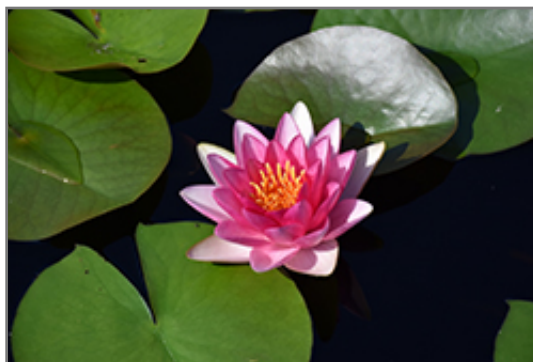
Attraction Hardy Water Lily flowers