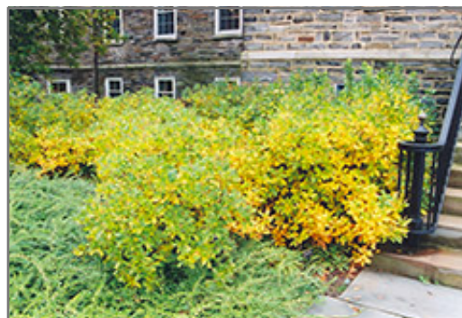
Summersweet in fall