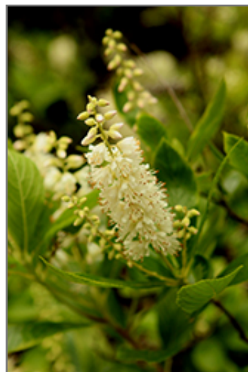
Summersweet flowers

Summersweet is recommended for the following landscape applications;