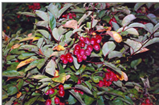
Adams Flowering Crab fruit

* This is a 'special order' plant - contact store for details