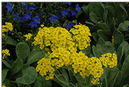
Basket Of Gold Alyssum flowers

Basket Of Gold Alyssum is recommended for the following landscape applications;