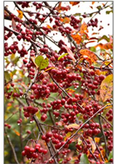
Prairifire Flowering Crab fruit

This tree should only be grown in full sunlight. It prefers to grow in average to moist conditions, and shouldn't be allowed to dry out. It is not particular as to soil type or pH. It is highly tolerant of urban pollution and will even thrive in inner city environments. This particular variety is an interspecific hybrid.