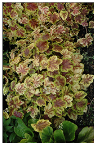
Solar Eclipse Foamy Bells