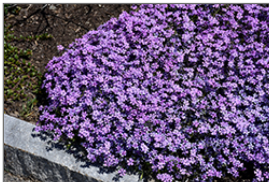
Purple Beauty Moss Phlox in bloom