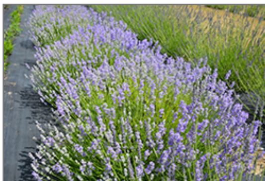
Blue Cushion Lavender in bloom