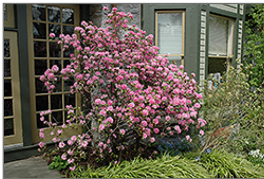
Olga Mezitt Rhododendron in bloom