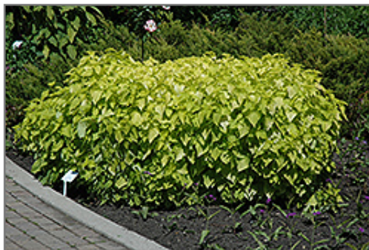
Golden Jubilee Anise Hyssop