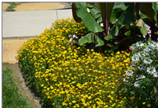
Goldilocks Rocks Bidens in bloom