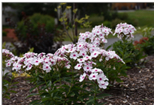
Flame White Eye Garden Phlox in bloom

85 CHIEF JUSTICE CUSHING HWY SCITUATE, MA 02066 781-545-1266