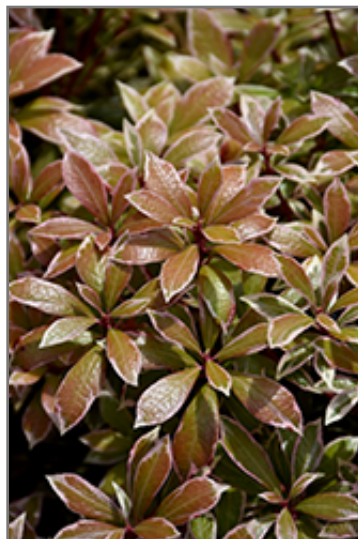
Little Heath Japanese Pieris foliage