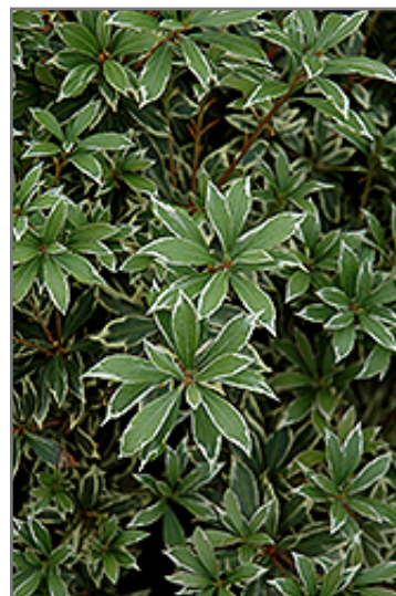
Little Heath Japanese Pieris foliage