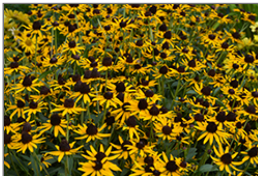
Little Goldstar Coneflower flowers