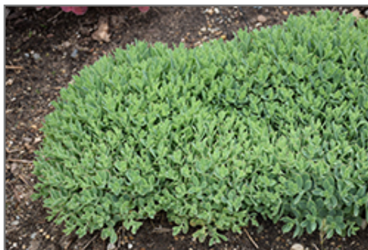
Rock 'N Round Pure Joy Stonecrop

* This is a 'special order' plant - contact store for details