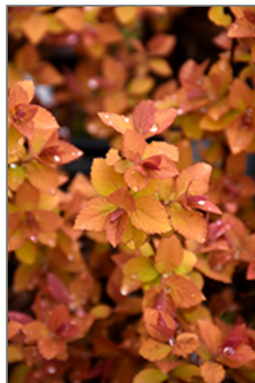
Double Play Big Bang Spirea foliage

This shrub should only be grown in full sunlight. It prefers to grow in average to moist conditions, and shouldn't be allowed to dry out. It is not particular as to soil type or pH. It is highly tolerant of urban pollution and will even thrive in inner city environments. This particular variety is an interspecific hybrid.