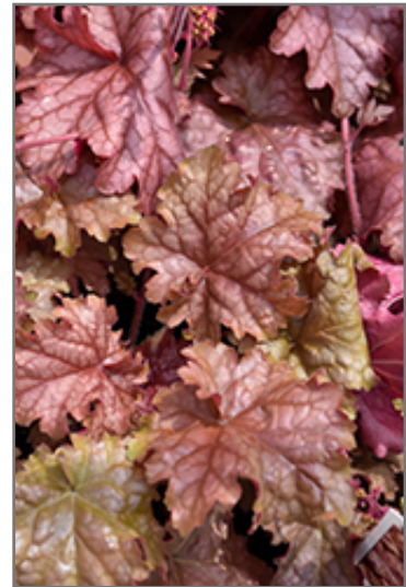
Carnival Peach Parfait Coral Bells foliage

Carnival Peach Parfait Coral Bells is recommended for the following landscape applications;