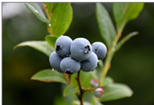
Northsky Blueberry fruit

Northsky Blueberry features dainty clusters of white bell-shaped flowers with shell pink overtones hanging below the branches in mid spring. It has green deciduous foliage. The glossy oval leaves turn an outstanding scarlet in the fall. It features an abundance of magnificent blue berries in mid summer.