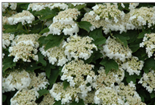
Compact European Cranberry flowers