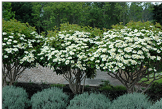
Compact European Cranberry in bloom

Compact European Cranberry is a dense multi-stemmed deciduous shrub with a more or less rounded form. Its average texture blends into the landscape, but can be balanced by one or two finer or coarser trees or shrubs for an effective composition.