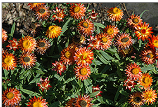
Sundaze Blaze Strawflower flowers