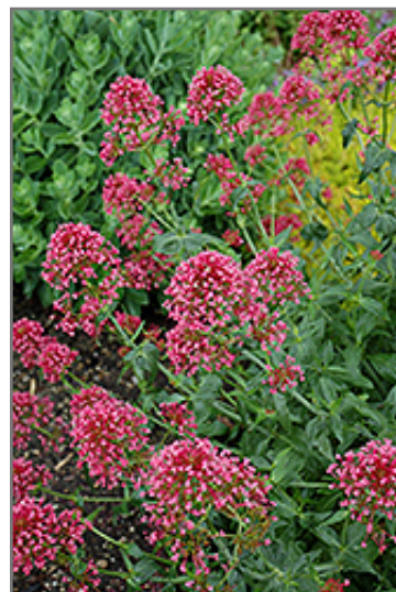
Red Valerian flowers

Red Valerian is recommended for the following landscape applications;