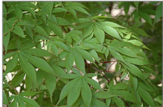
Osakazuki Japanese Maple foliage

This is a relatively low maintenance tree, and should only be pruned in summer after the leaves have fully developed, as it may 'bleed' sap if pruned in late winter or early spring. It has no significant negative characteristics.