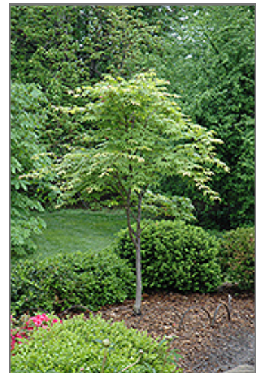
Osakazuki Japanese Maple