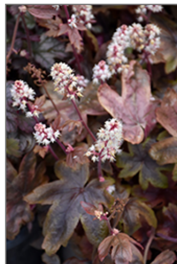
Brass Lantern Foamy Bells flowers

85 CHIEF JUSTICE CUSHING HWY SCITUATE, MA 02066 781-545-1266