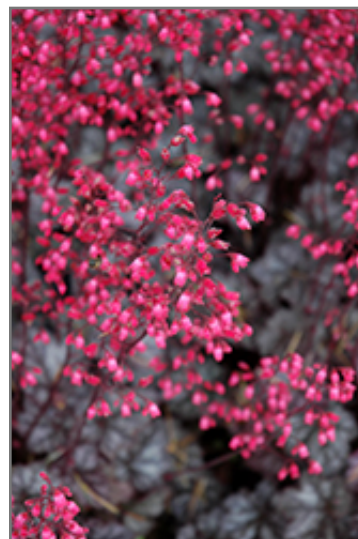
Glitter Coral Bells flowers

* This is a 'special order' plant - contact store for details