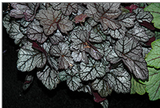
Glitter Coral Bells foliage