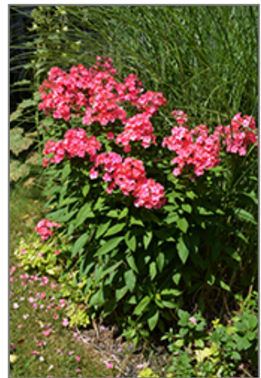
Flame Coral Garden Phlox in bloom