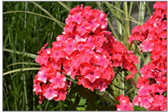
Flame Coral Garden Phlox flowers