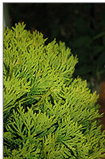
Anna's Magic Ball Arborvitae foliage