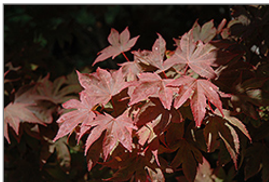
Ruslyn In The Pink Japanese Maple foliage

Ruslyn In The Pink Japanese Maple is recommended for the following landscape applications;