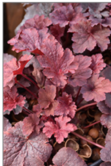
Cajun Fire Coral Bells foliage

Cajun Fire Coral Bells is recommended for the following landscape applications;