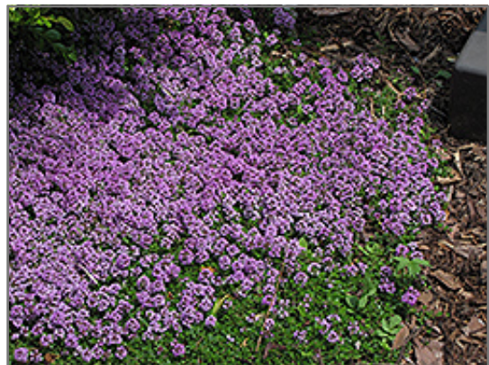
Purple Carpet Creeping Thyme in bloom