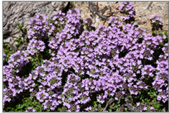
Purple Carpet Creeping Thyme flowers