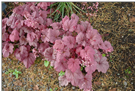
Georgia Plum Coral Bells