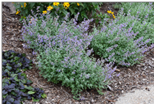
Purrsian Blue Catmint in bloom