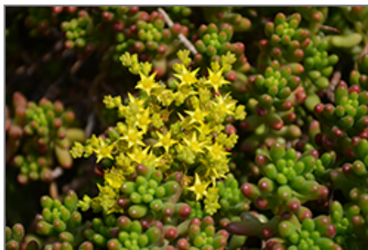
Jelly Bean Plant flowers

Jelly Bean Plant will grow to be only 5 inches tall at maturity, with a spread of 14 inches. When grown in masses or used as a bedding plant, individual plants should be spaced approximately 10 inches apart. Its foliage tends to remain low and dense right to the ground. It grows at a medium rate, and under ideal conditions can be expected to live for approximately 10 years. As an evergreen perennial, this plant will typically keep its form and foliage year-round.