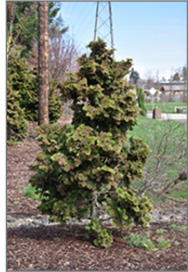
Koster's Falsecypress

* This is a 'special order' plant - contact store for details