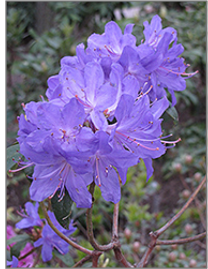
Blue Baron Rhododendron flowers