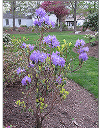
Blue Baron Rhododendron in bloom

This shrub does best in full sun to partial shade. You may want to keep it away from hot, dry locations that receive direct afternoon sun or which get reflected sunlight, such as against the south side of a white wall. It requires an evenly moist well-drained soil for optimal growth, but will die in standing water. It is very fussy about its soil conditions and must have rich, acidic soils to ensure success, and is subject to chlorosis (yellowing) of the foliage in alkaline soils. It is somewhat tolerant of urban pollution, and will benefit from being planted in a relatively sheltered location. Consider applying a thick mulch around the root zone in winter to protect it in exposed locations or colder microclimates. This particular variety is an interspecific hybrid.