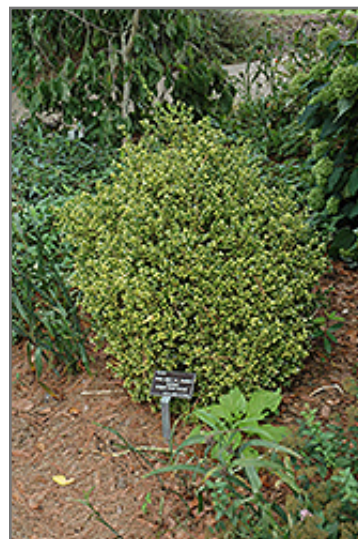
Sunburst Variegated Korean Boxwood