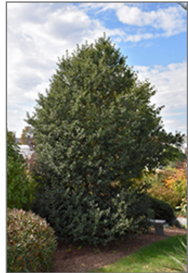
Dragon Lady Holly