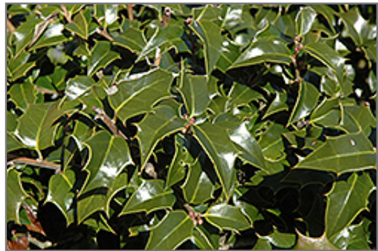
Dragon Lady Holly foliage