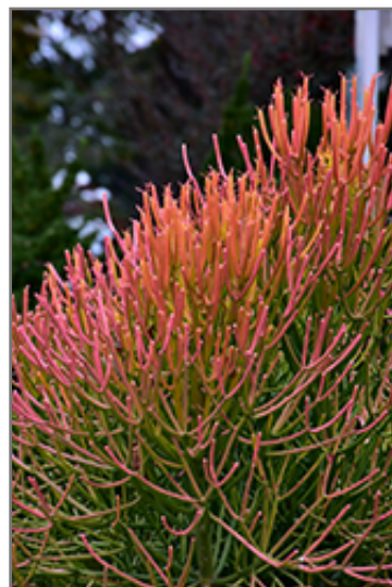
Sticks On Fire Red Pencil Tree foliage

Sticks On Fire Red Pencil Tree is recommended for the following landscape applications;