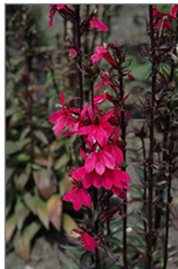
Starship Deep Rose Lobelia flowers

Starship Deep Rose Lobelia is recommended for the following landscape applications;