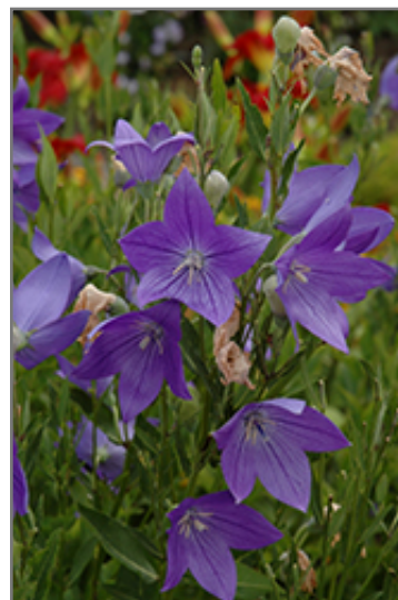
Fuji Blue Balloon Flower flowers