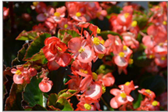
BabyWing Bicolor Begonia flowers

This is a high maintenance plant that will require regular care and upkeep, and usually looks its best without pruning, although it will tolerate pruning. Deer don't particularly care for this plant and will usually leave it alone in favor of tastier treats. Gardeners should be aware of the following characteristic(s) that may warrant special consideration;