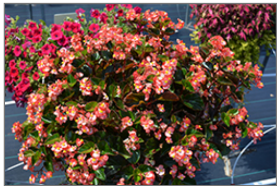
BabyWing Bicolor Begonia in bloom