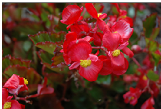
BabyWing Red Begonia flowers

BabyWing Red Begonia is a fine choice for the garden, but it is also a good selection for planting in outdoor containers and hanging baskets. It is often used as a 'filler' in the 'spiller-thriller-filler' container combination, providing a mass of flowers and foliage against which the thriller plants stand out. Note that when growing plants in outdoor containers and baskets, they may require more frequent waterings than they would in the yard or garden.