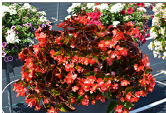
BabyWing Red Begonia in bloom