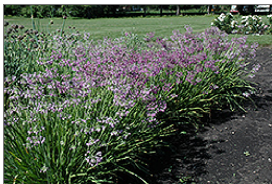
Nodding Onion in bloom