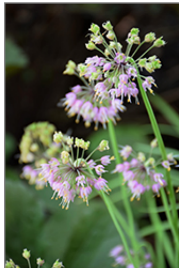
Nodding Onion flowers

This plant should only be grown in full sunlight. It does best in average to evenly moist conditions, but will not tolerate standing water. It is not particular as to soil type or pH, and is able to handle environmental salt. It is highly tolerant of urban pollution and will even thrive in inner city environments. This species is native to parts of North America. It can be propagated by multiplication of the underground bulbs.