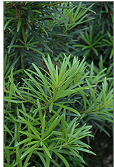
Japanese Yew foliage

When grown indoors, Japanese Yew can be expected to grow to be about 6 feet tall at maturity, with a spread of 3 feet. It grows at a slow rate, and under ideal conditions can be expected to live for approximately 50 years. This houseplant will do well in a location that gets either direct or indirect sunlight, although it will usually require a more brightly-lit environment than what artificial indoor lighting alone can provide. It does best in average to evenly moist soil, but will not tolerate standing water. The surface of the soil shouldn't be allowed to dry out completely, and so you should expect to water this plant once and possibly even twice each week. Be aware that your particular watering schedule may vary depending on its location in the room, the pot size, plant size and other conditions; if in doubt, ask one of our experts in the store for advice. It is not particular as to soil type or pH; an average potting soil should work just fine.