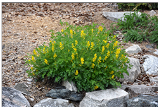
Golden Corydalis in bloom

Golden Corydalis will grow to be about 12 inches tall at maturity, with a spread of 12 inches. Its foliage tends to remain dense right to the ground, not requiring facer plants in front. It grows at a medium rate, and under ideal conditions can be expected to live for approximately 5 years. As an herbaceous perennial, this plant will usually die back to the crown each winter, and will regrow from the base each spring. Be careful not to disturb the crown in late winter when it may not be readily seen!