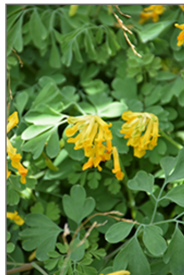
Golden Corydalis flowers