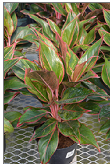
Siam Aurora Chinese Evergreen in full