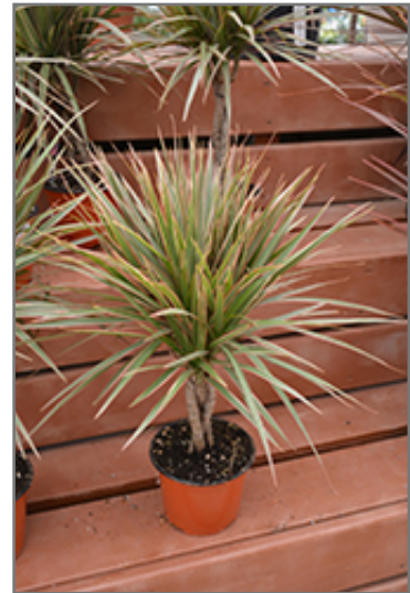
Colorama Dracaena in full

When grown indoors, Colorama Dracaena can be expected to grow to be about 3 feet tall at maturity, with a spread of 24 inches. It grows at a medium rate, and under ideal conditions can be expected to live for approximately 10 years. This houseplant performs well in both bright or indirect sunlight and strong artificial light, and can therefore be situated in almost any well-lit room or location. It does best in average to evenly moist soil, but will not tolerate standing water. The surface of the soil shouldn't be allowed to dry out completely, and so you should expect to water this plant once and possibly even twice each week. Be aware that your particular watering schedule may vary depending on its location in the room, the pot size, plant size and other conditions; if in doubt, ask one of our experts in the store for advice. It is not particular as to soil type or pH; an average potting soil should work just fine.